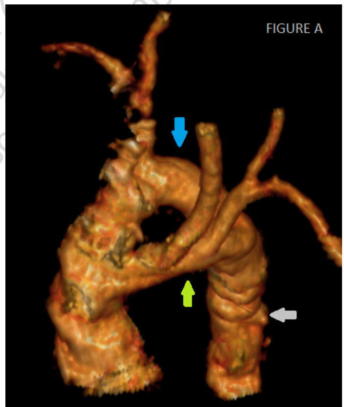
Figure A. 3D VRT (volume rendered technique) image in left superior oblique projection showing double aortic arch with anterior (left) aortic arch shown by yellow arrow and posterior (right) aortic arch shown by blue arrow) joining together to form descending thoracic aorta (gray arrow).

Address for correspondence: Priyadarshini Arunakumar, DM; Sree Chitra Tirunal Institute for Medical Sciences and Technology, Trivandrum, India. Email: priya_arun_2000@yahoo.com